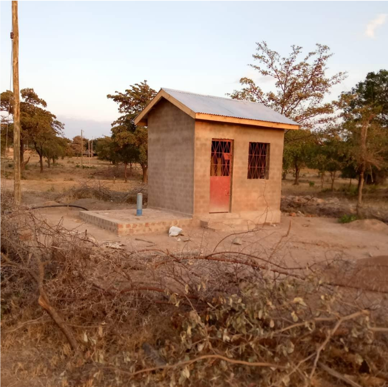
Figure 1: Pump House and Electric Poles