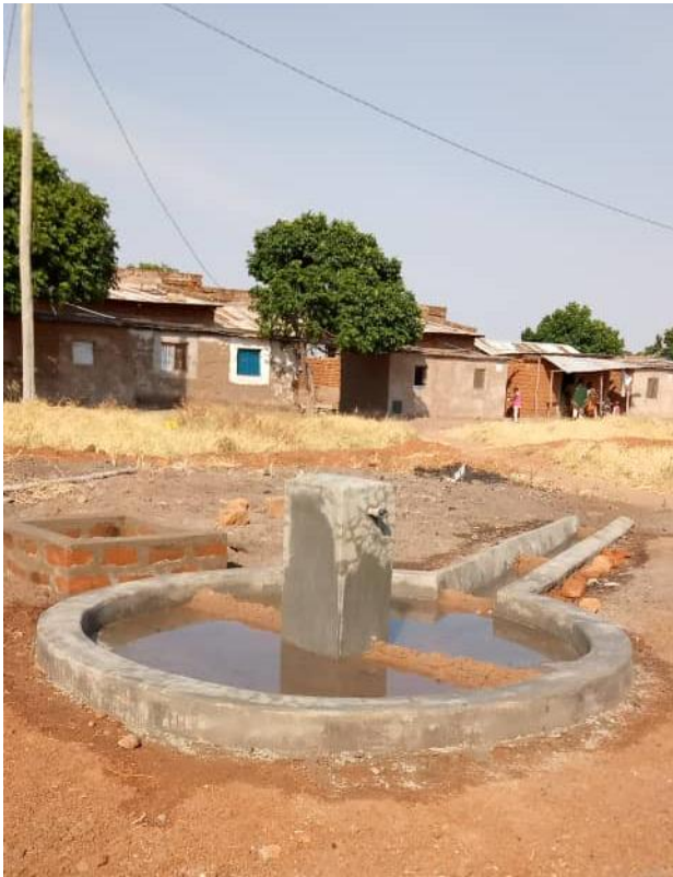
Figure 3: Double Tap water Point Constructera at Prison Camp .