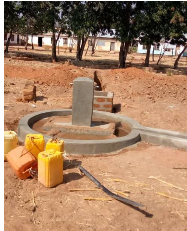
Figure4: Double Tap water Point Constructed at Primary School