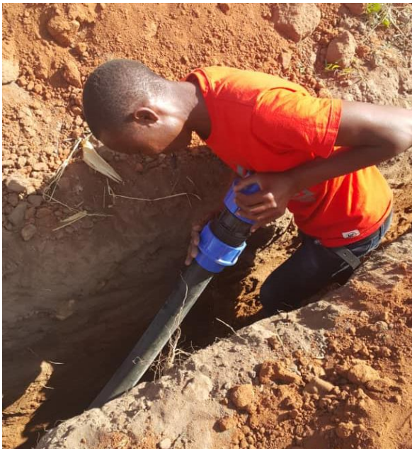
Figure5: Laying of Pipeline