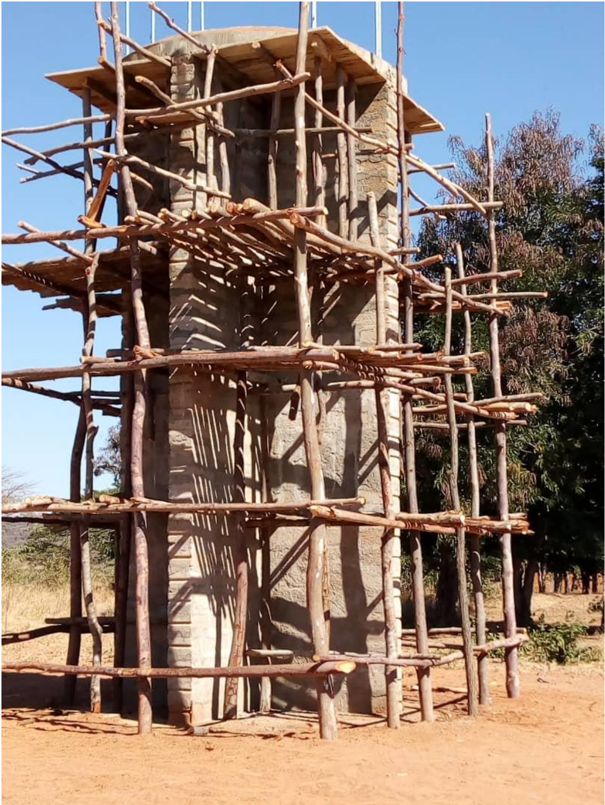
Figure 2: Tank riser ( Construction work has completed)